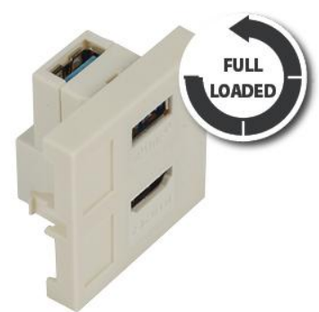
2 PORT HDMI&USB 3.0 FACE PLATE

Art No Product Description FO-AD-HDMI 22,5 X 45 HDMI Adaptor