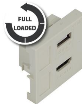
2 PORT HDMI&USB 2.0 FACE PLATE