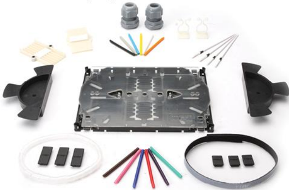
Fiber Optic Splice Connecting Kit (12 Ports) TTAF Code: FO-EA-12